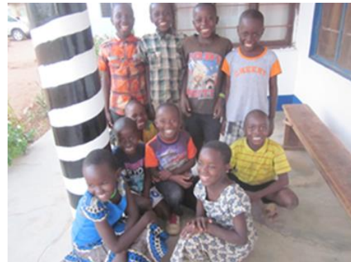
Orphans living at the Trade School