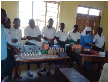
New electrical equipment

During the year the electrical system at the Trade School was upgraded. This is now part solar and part from the rural grid which has eventually reached the village. The photos below show some of the new equipment we purchased and had installed.