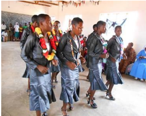
2015 Trade School graduates

With your kind donations the education of some forty children continues to be sponsored. Eleven of these are orphan girls studying at the Trade School, seven at Mtandika Primary School, eighteen at Mtandika Secondary School and other boarding schools away from the village and four at various Colleges studying practical subjects. The photo on the left below shows this year's graduates from the Trade School in clothes that they have sewn themselves. The photo on the right shows some of the younger orphans living at the Trade School who attend Mtandika Primary School. They are looked after wonderfully by the older girls in a lovely family atmosphere.