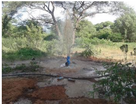
Borehole before capping off water

Other infrastructural work included the sinking of a borehole on the flood plain above but close to the river, so that there will always be water at a shallow depth but the pump will be away from strong flood flows in the river. The photo below shows the borehole before being capped and the installation of a solar pump and solar panels.