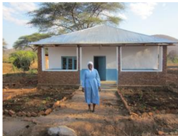
New teachers house