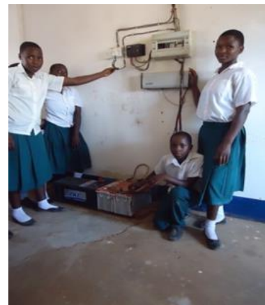
New electrical switch gear

The Trade School course now has to cover many more subjects to comply with National Exam standards and during the year we sent money for Sister to purchase more computers [as shown below] and sewing machines. All graduates now take the national VETA exams.