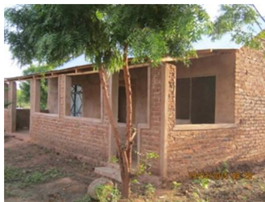
Maize mill building

Whilst staying with Sister she was sending the girls some distance into one of the nearby villages to get maize she had grown, ground into flour. This was not only costly but potentially dangerous for the girls. So we agreed that she should buy a mill and construct a building to house it. The building [shown below] also provides premises for a small shop and accommodation for the askari [guard].