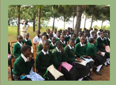
If you would like to see the short film of our 2019 visit to Nyaishozi, visit us at: http://www.actioninafrica.org

You can get in touch with us at: actioninafrica.ashtead@gmail