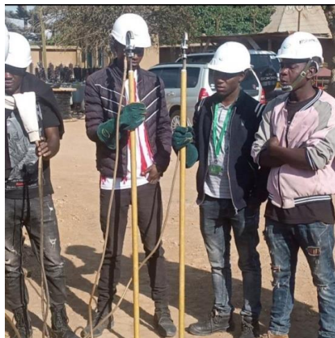
Past Electrical Students

Feedback from past students shows that they have all ended up with very good, well-paid jobs. Many of the electrical students end up working for TanESCO, the state power company equivalent to UK's National Grid.