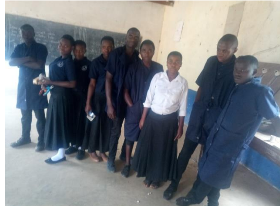
Second Year Electrical Students

Feedback from past students shows that they have all ended up with very good, well-paid jobs. Many of the electrical students end up working for TanESCO, the state power company equivalent to UK's National Grid.