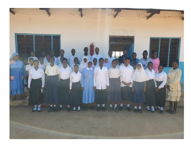
The 2024 Students with the Sisters and Teachers

In 2024 there are twenty nine students, eleven on the Electrical course with nine in Year 1 and two in year 2, twelve on the Tailoring course with eleven in Year 1 and one in Year 2 and six on the first year of the Hotel Management course.