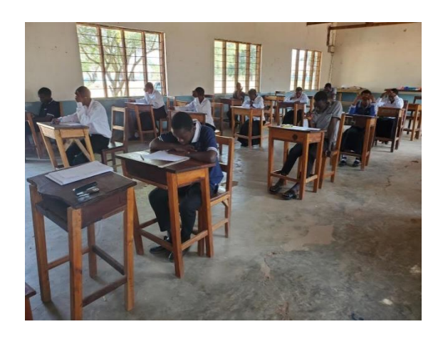
Students in Exam

VETA indicated that the exam results from St Agnes VTC for 2023 were excellent and their Manager congratulated the teachers on achieving such good results.