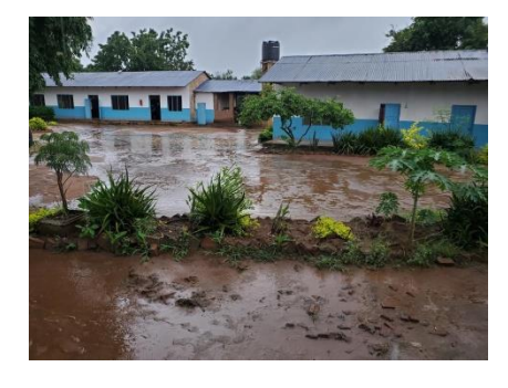
Flooding around the college buildings