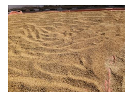
Rice drying after harvesting