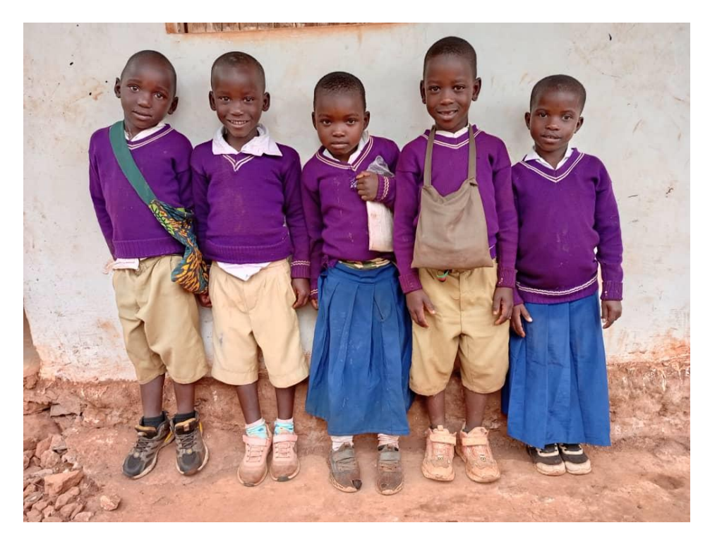
Pictured above are our Y1 intake 2024 at Kasheshe Primary School. We will support these children until they decide to leave formal education.