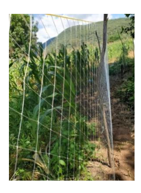
Fencing to protect crop from monkeys

The following areas were planted: 13 hectares of maize giving 84 sacks; 3 hectares of beans giving 21 sacks; ¼ hectare of bananas; ¼ hectare of cassava, although this was badly affected by elephants; ocra giving 17 sacks; 1 hectare of onions giving 30 sacks.