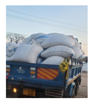
Rice being transported from one of the college's distant 'shambas'