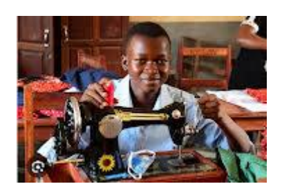
2023 Tailoring Graduates who already have jobs

In 2024 there are twenty nine students, eleven on the Electrical course with nine in Year 1 and two in year 2, twelve on the Tailoring course with eleven in Year 1 and one in Year 2 and six on the first year of the Hotel Management course.