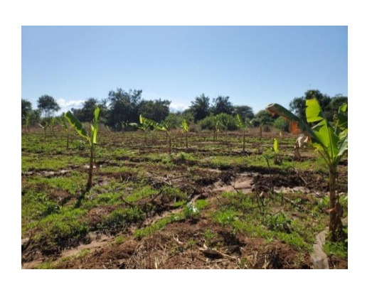
Replanted bananas after elephant damage