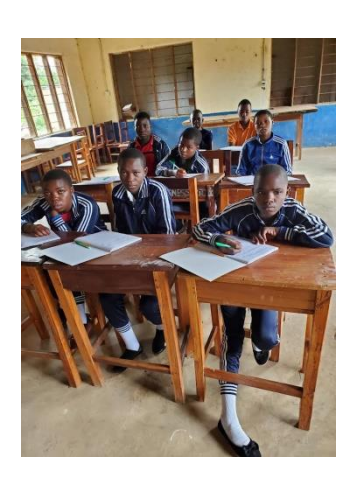
Hotel Management Students in class