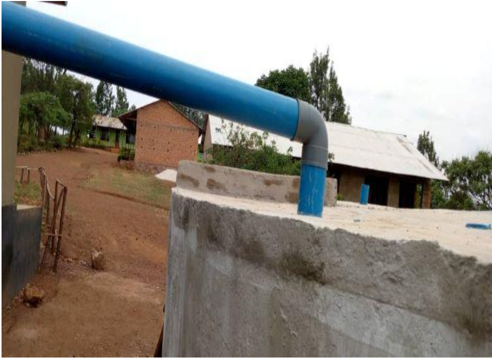
THE RAINWATER HARVEST TANK AT RUGU SCHOOL (COMPLETED SEPTEMBER 2022)