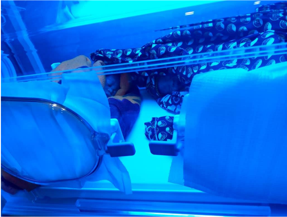
A MIRACLE ON CHRISTMAS EVE AT NYAISHOZI DISPENSARY